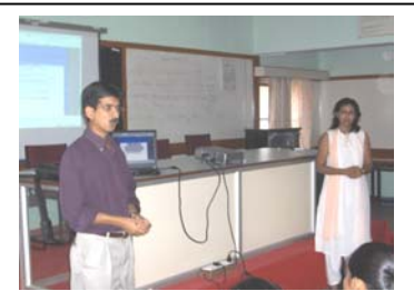
A representative from MetLife Insurance talks about Careers in Insurance

Bangalore such as Hewlett Packard, MetLife, Ravi and Associates gave an overview of the career paths and options available in each of the areas indicating the kind of skills needed for the same.