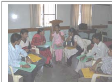
What else do we need to further our academics...A group discussion in progress

ILP organized a career counseling seminar for students pursuing the commerce stream, on the 28 th of August 2005. The seminar had 5 sessions: Corporate Finance, Banking, Insurance, Accounting BPOs, Chartered Accountancy. Representatives from Corporate Sector organizations in