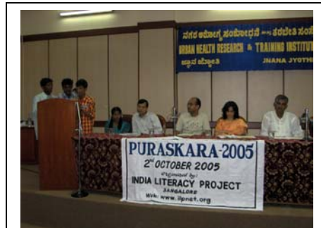
Puraskara - 2005

All children have a right to education, a happy childhood and balanced development- but the truth remains that several children still work to support themselves and their families. Education has evolved as a key intervention in releasing children out of work situations. Elementary education (to 7 th standard) being almost free in government schools these children continue their education until 7 th standard. Further, incentives such as free uniforms, mid-day meals, textbooks etc. also help in ensuring that these children do not drop out due lack of financial resources.