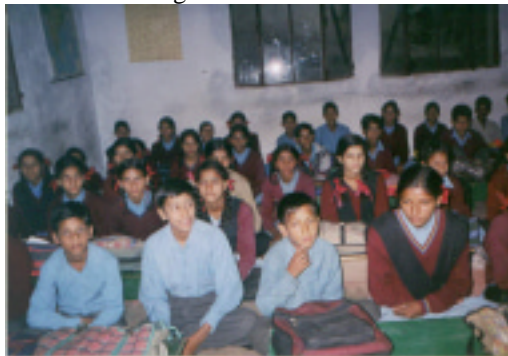
SIDH, Uttaranchal: The journey from teaching to learning.