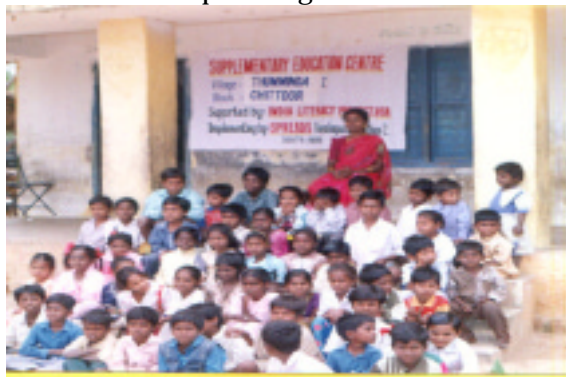
SPREADS, Chittor, Andhra Pradesh: Supplemental education center