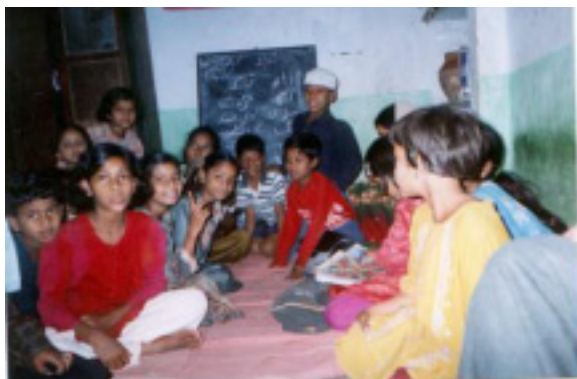
Mahita, Old Hyderabad, Andhra Pradesh: Non-formal education center and Balwadis.